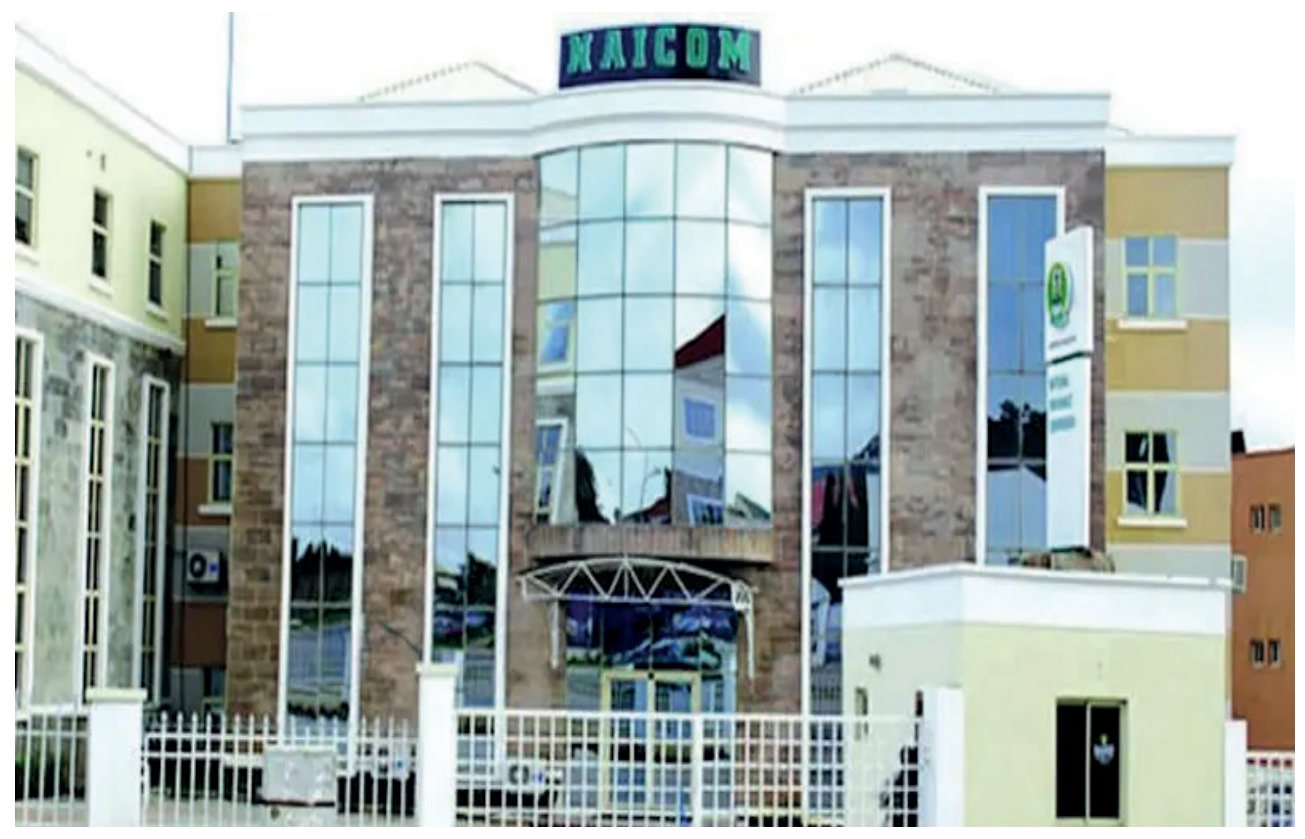
National Insurance Commission, Abuja, Nigeria

the lower level of the pyramid who are generally called the Grasstoots. The National Insurance — Commission has been part of the National Policy on Financial Inclusion initiative coordinated by the Central Bank of Nigeria under the Financial Services Regulatory Coordinating Committee (FSRCC) Part of the objective of the Financial Inclusion initiative is to bring everybody on board by enabling access to financial services, making financial products available at affordable price and promote financial education among the citizen.